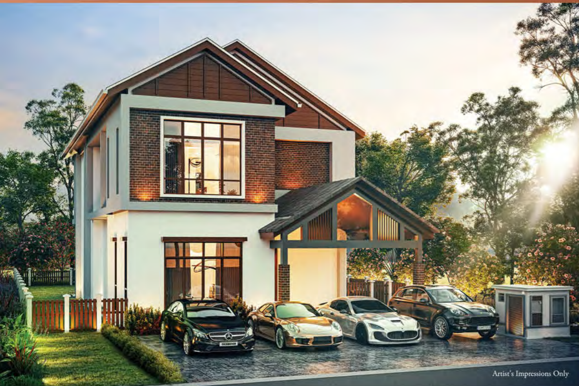
Artist's Impressions Only

The double-volume living spaces at Robin Cove elevate your everyday life, offering a sense of grandeur and openness that is rarely found. These expansive areas flood the home with natural light, creating an atmosphere of airiness and luxury that is perfect for both relaxation and entertaining. Experience the true meaning of spacious living.