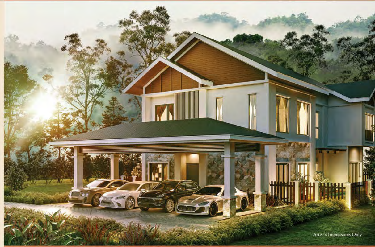
Artist's Impressions Only