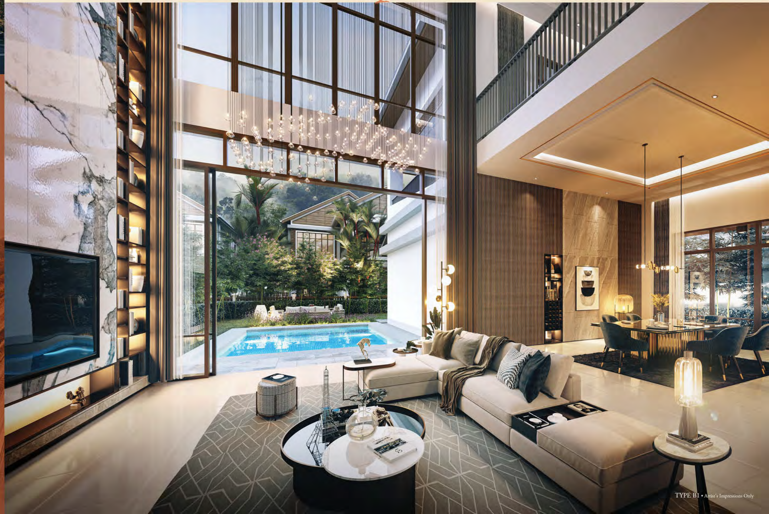
TYPE B1 • Artist's Impressions Only

The double-volume living spaces at Robin Cove elevate your everyday life, offering a sense of grandeur and openness that is rarely found. These expansive areas flood the home with natural light, creating an atmosphere of airiness and luxury that is perfect for both relaxation and entertaining. Experience the true meaning of spacious living.