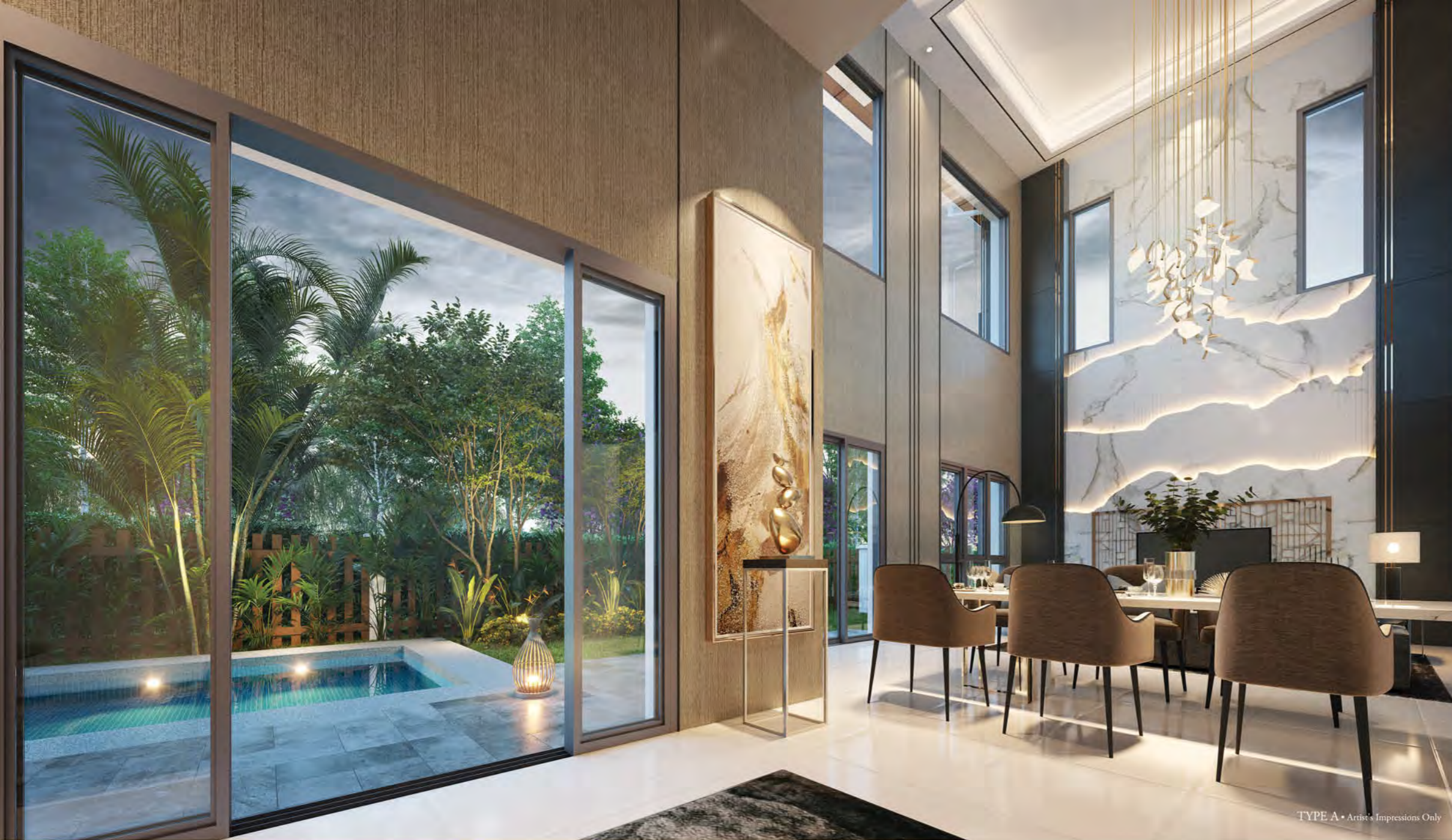
TYPE A • Artist's Impressions Only