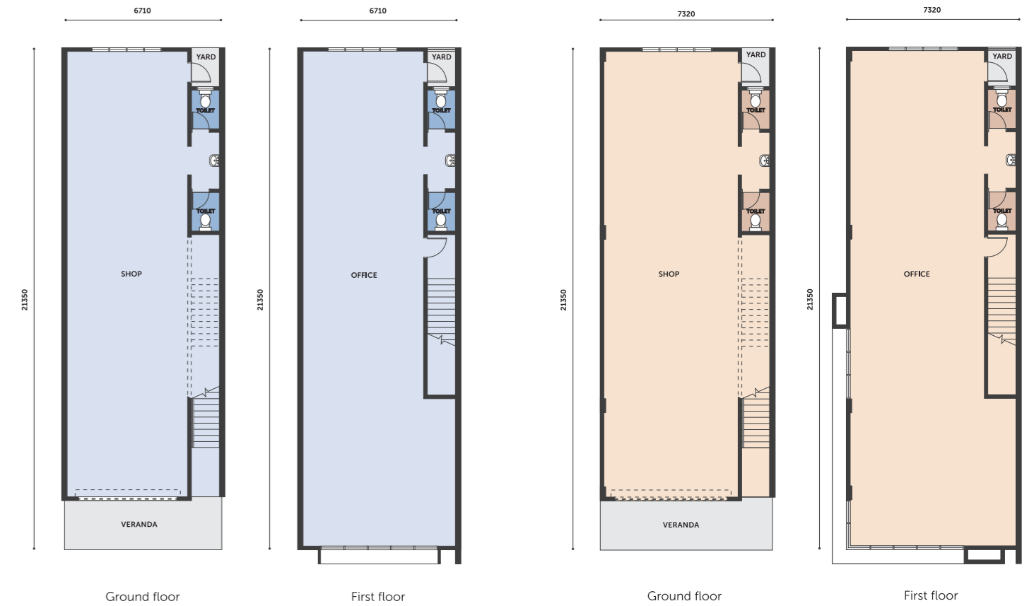
CCBH PHASE 2 Intermediate Unit - 22' x 70'