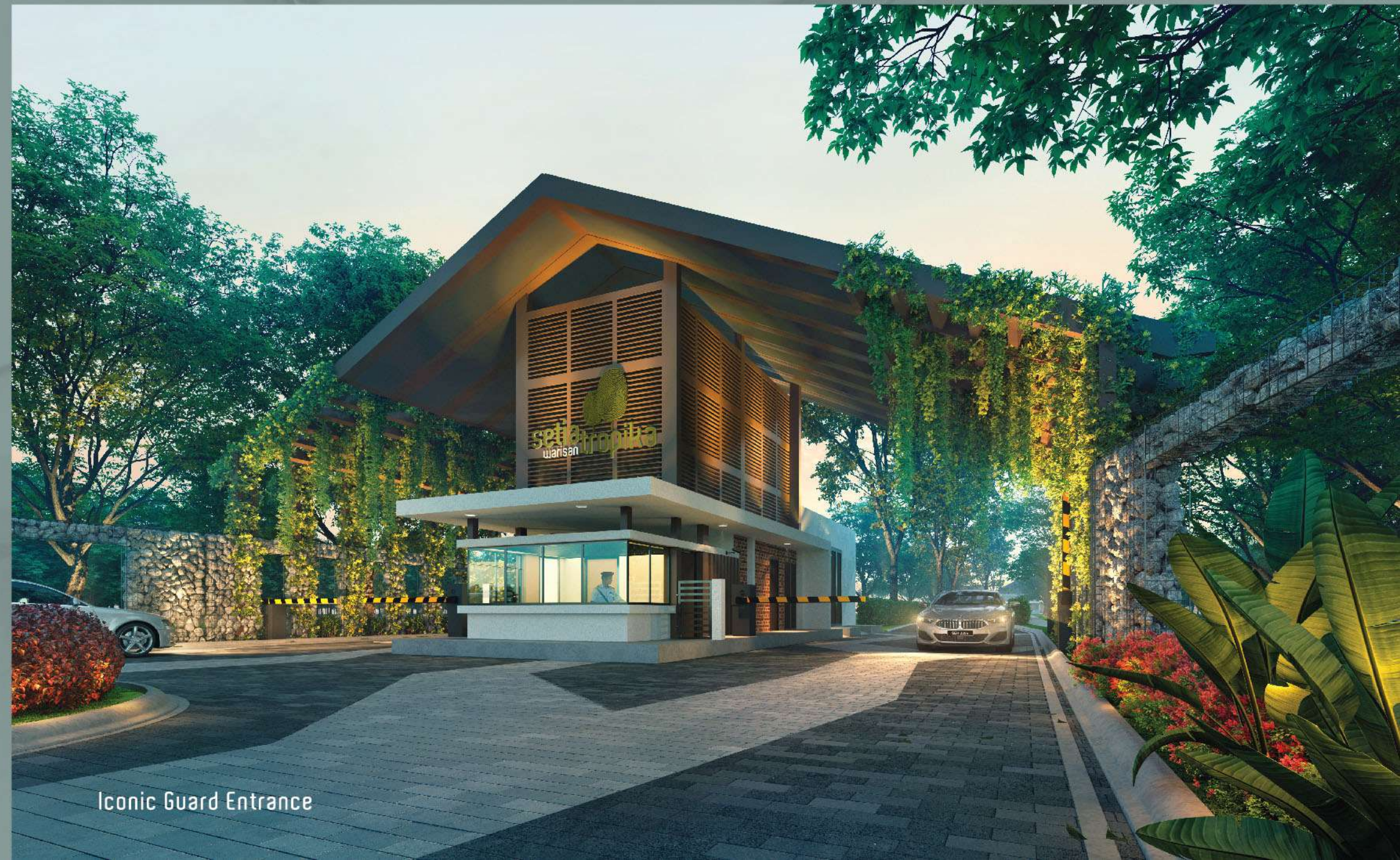
Iconic Guard Entrance

Gated & Guarded environment. Single entry point with security features.