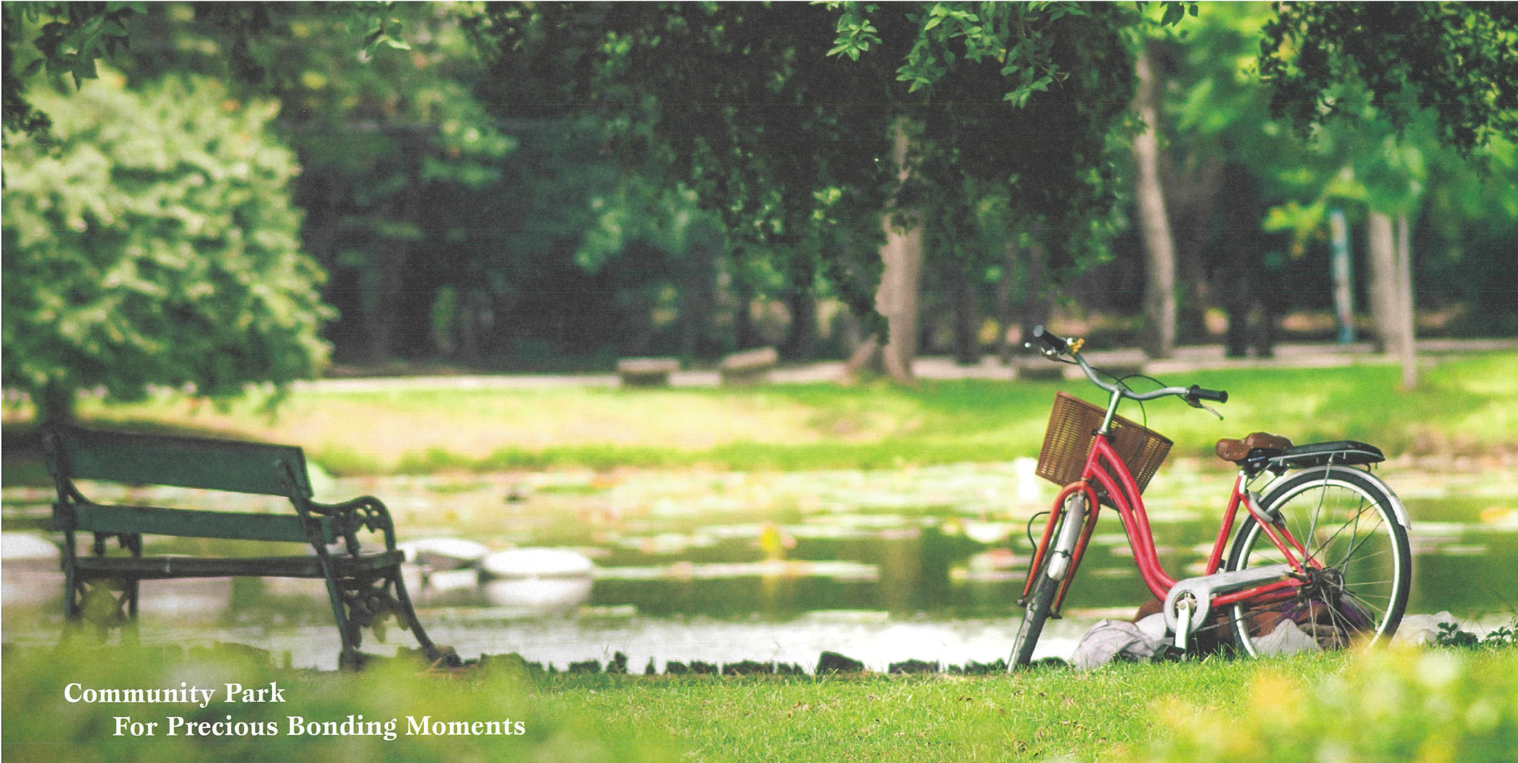
Community Park For Precious Bonding Moments