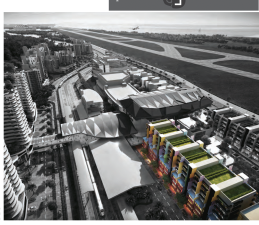
Block H fronting the upgraded Tanjung Aru Railway Station