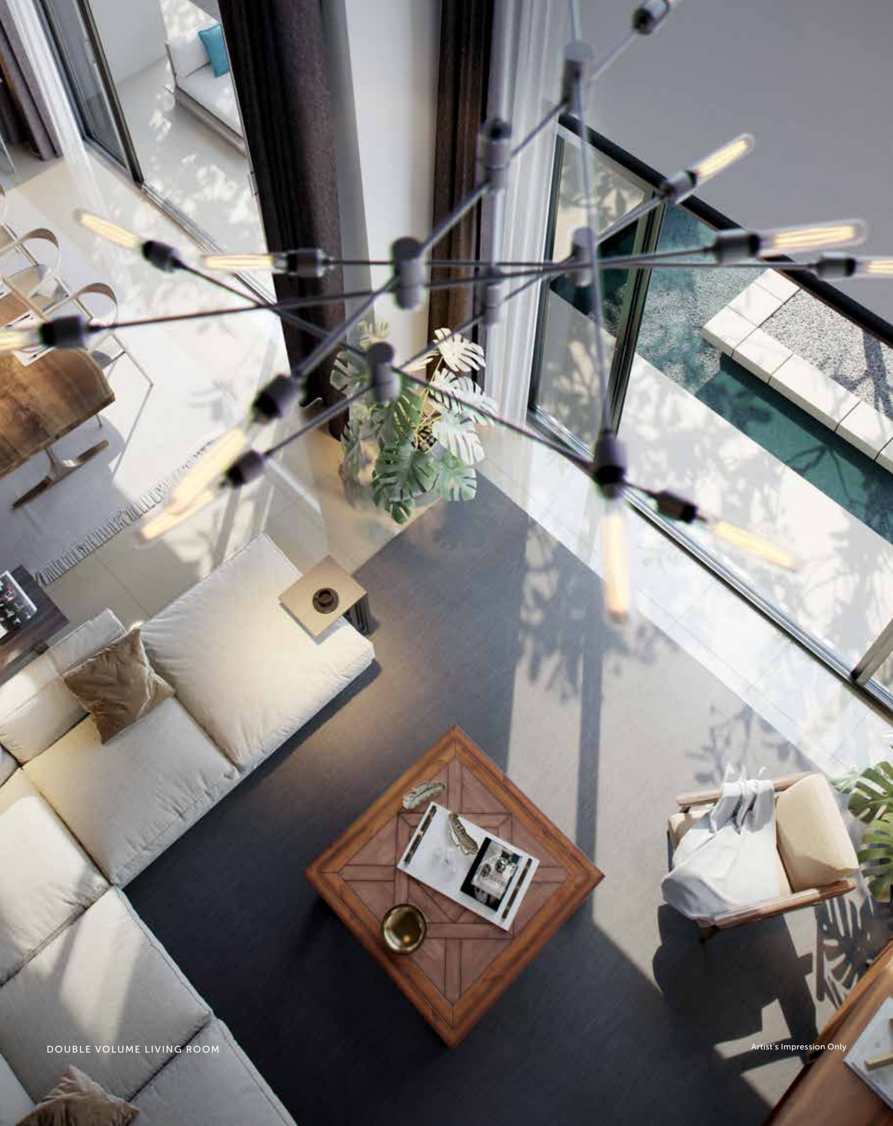
DOUBLE VOLUME LIVING ROOM