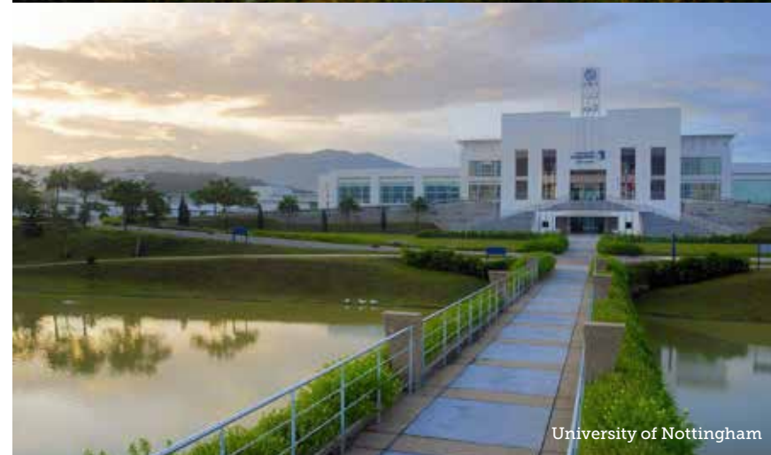
University of Nottingham