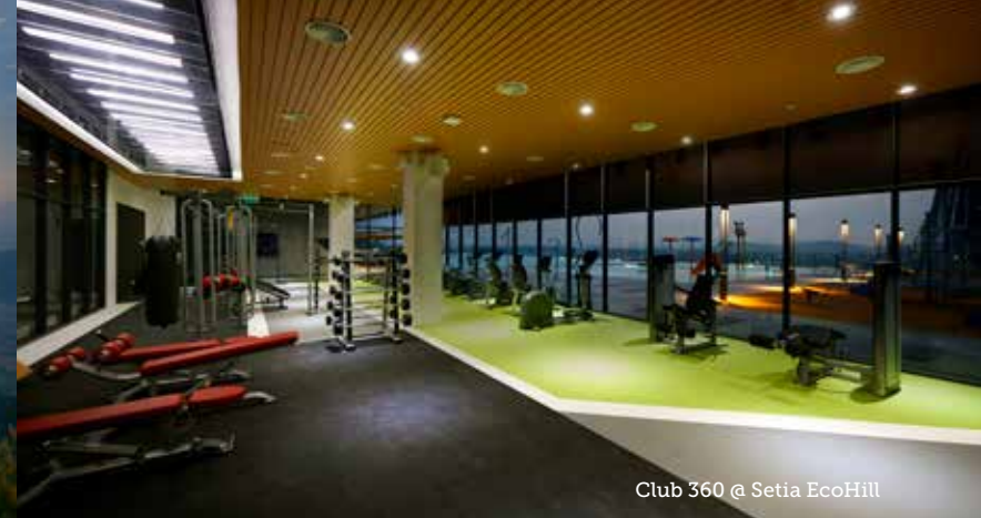
Club 360 @ Setia EcoHill