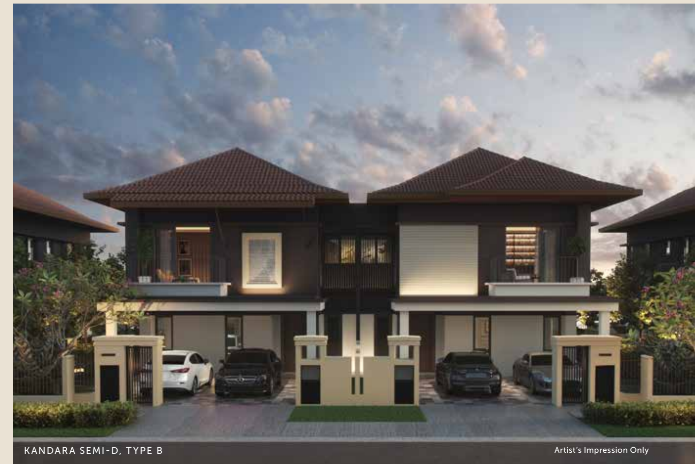
KANDARA SEMI-D, TYPE B

WE SEARCH FOR NEW EXPERIENCES, LOVE AND COMPANIONSHIP. YET IT IS ALWAYS THE WARMTH OF HOME THAT WE SEEK