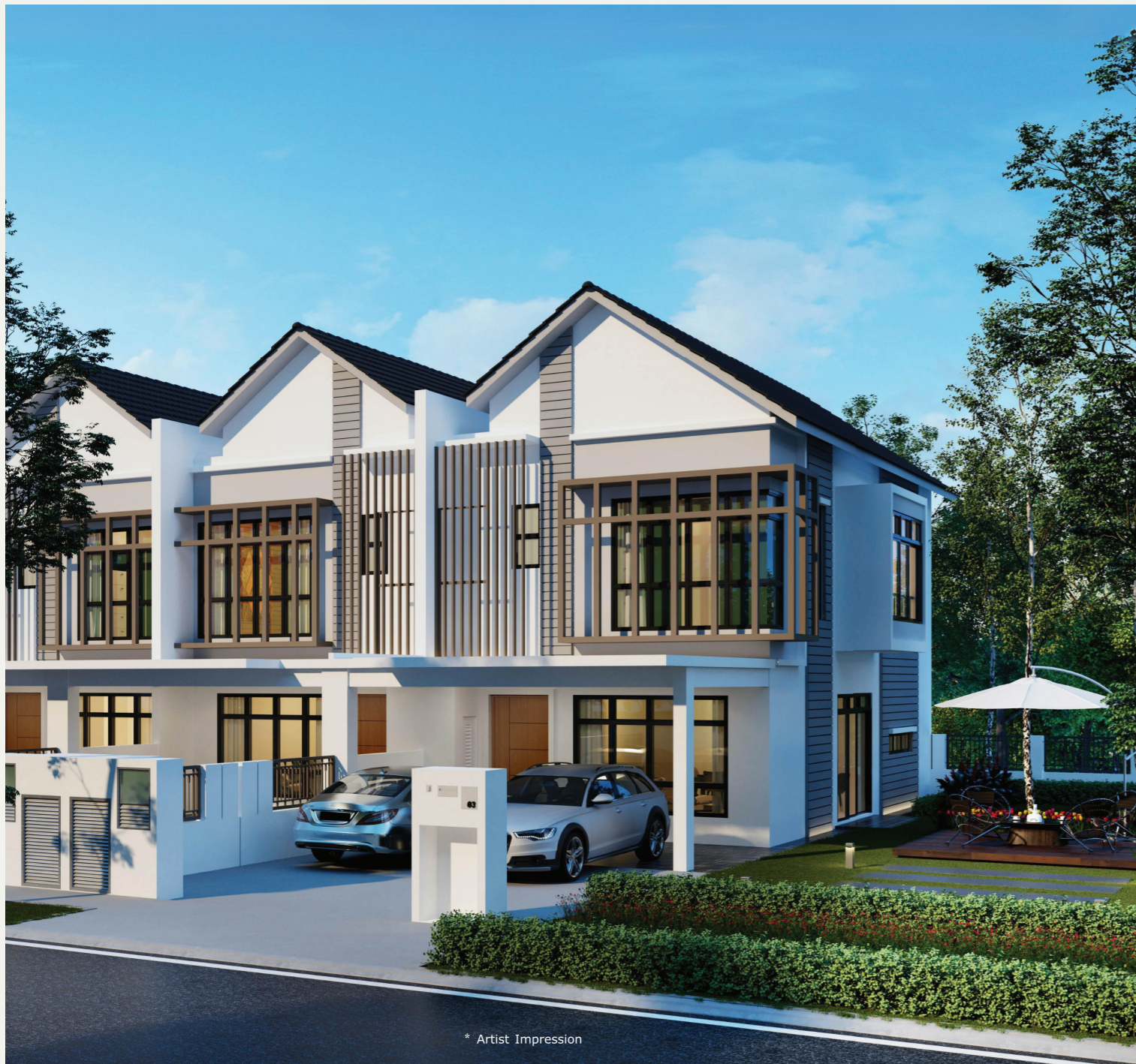
* Artist Impression