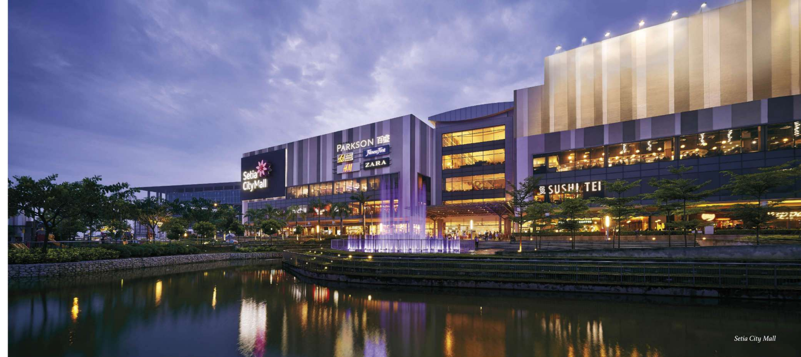
Setia City Mall