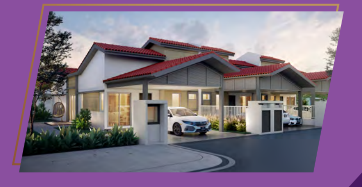
Rejoice 22' x 73' SINGLE STOREY TERRACE

Live life to the fullest with 5 distinctive and distinguished types of abode, each with its own charisma. From bigger spaces to better designs, take your pick on what sort of attention to detail makes you come to life at home.